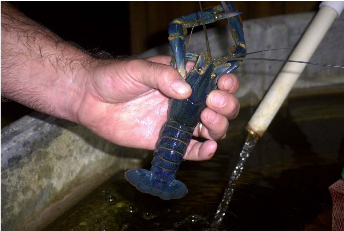
Figure 1. Australian Redclaw crayfish are freshwater species whose growth can be accelerated using heat from geothermal water.