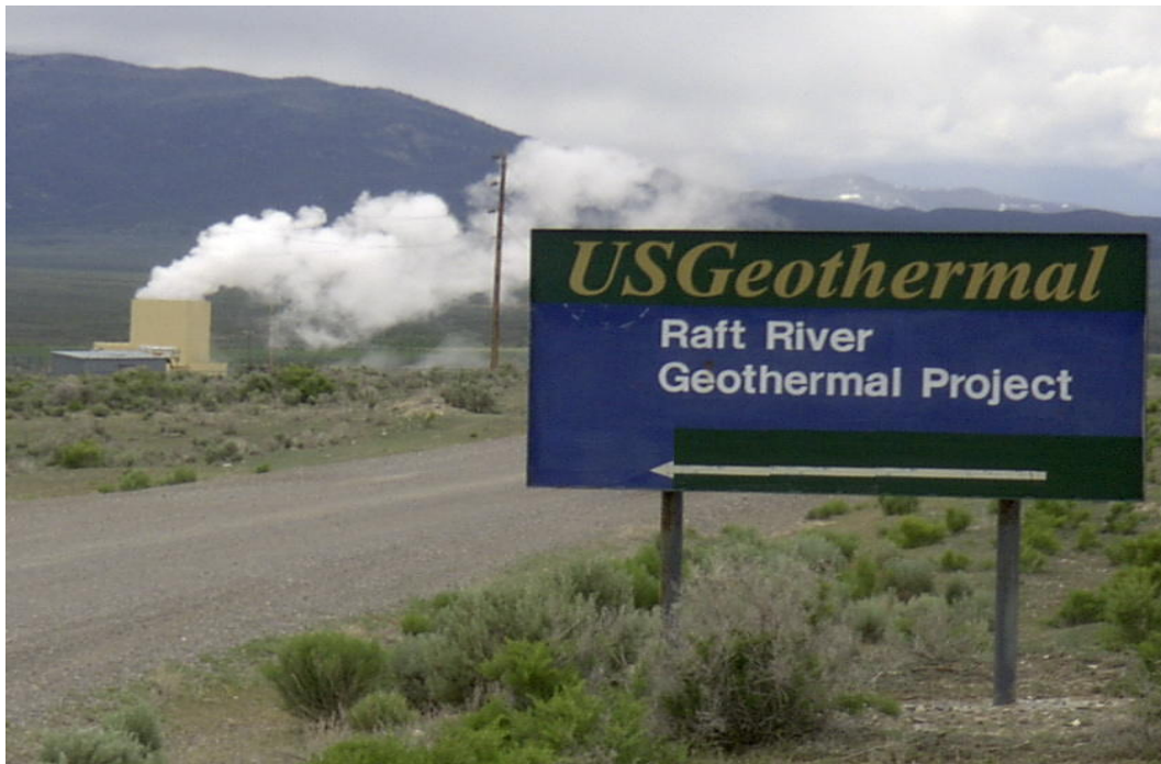
Figure 2. The wide and dry valley floor of Raft River in Cassia County of south-central Idaho is to be the home of Idaho's first geothermal power plant and also the business location of Idaho Redclaw Farms, LLC.

to become a cascading geothermal application downstream of the future power plant. Since 2004, when Redclaw Farms arrived at the Raft River location in Cassia County, the brood stock has been reproducing steadily. Neil initially set up the crayfish aquariums and tanks in the living room of his home at Raft River, and then later moved the operation into an existing nearby steel building which now contains six pools for maturing crayfish, and two tanks for breeders (Figure 3). As of May 2005, Redclaw Farms had a couple hundred crayfish in the brood stock, 600-700 maturing individuals, and a couple thousand crayfish babies.