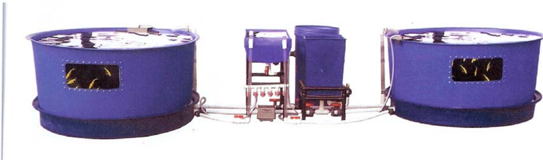
Figure 2 Typical Educational Aquaculture Tanks

Part of the plan for the use of the greenhouses may involve a small aquaculture lab in one of the structures. The exact configuration of the aquaculture arrangement is not known. To evaluate this potential use of the geothermal water, it was assumed that the commonly used 6 ft diameter tanks available from aquaculture suppliers would be used here. These packaged aquaculture systems (figure 2) normally consist of two 6 ft diameter approximately 500 gallon tanks linked to a small bio filter for water quality control. The use of the bio filter limits the need for make-up water to approximately 10 gal per day thus limiting the issue of water disposal. In the context of a greenhouse facility such as this, presumably the nutrient rich water removed from the tanks could be used for irrigation of the plants in the other structures.