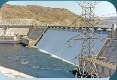
Grand Coulee Dam