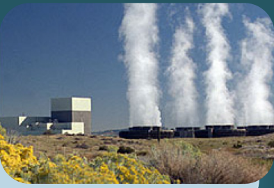
Columbia Generating Station