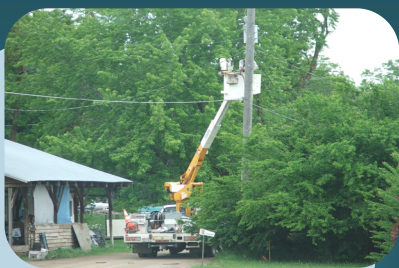
Workers inspect electrical infrastructure in Idaho.