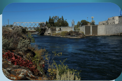
Idaho Falls Power City Plant in Idaho Falls, Idaho.